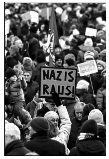
Solidarity | ISSUE ONE HUNDRED AND EIGHTY FEBRUARY 2024

International 13 Mass protests against German AfD as far right rises 18 Myanmar's generals facing defeat