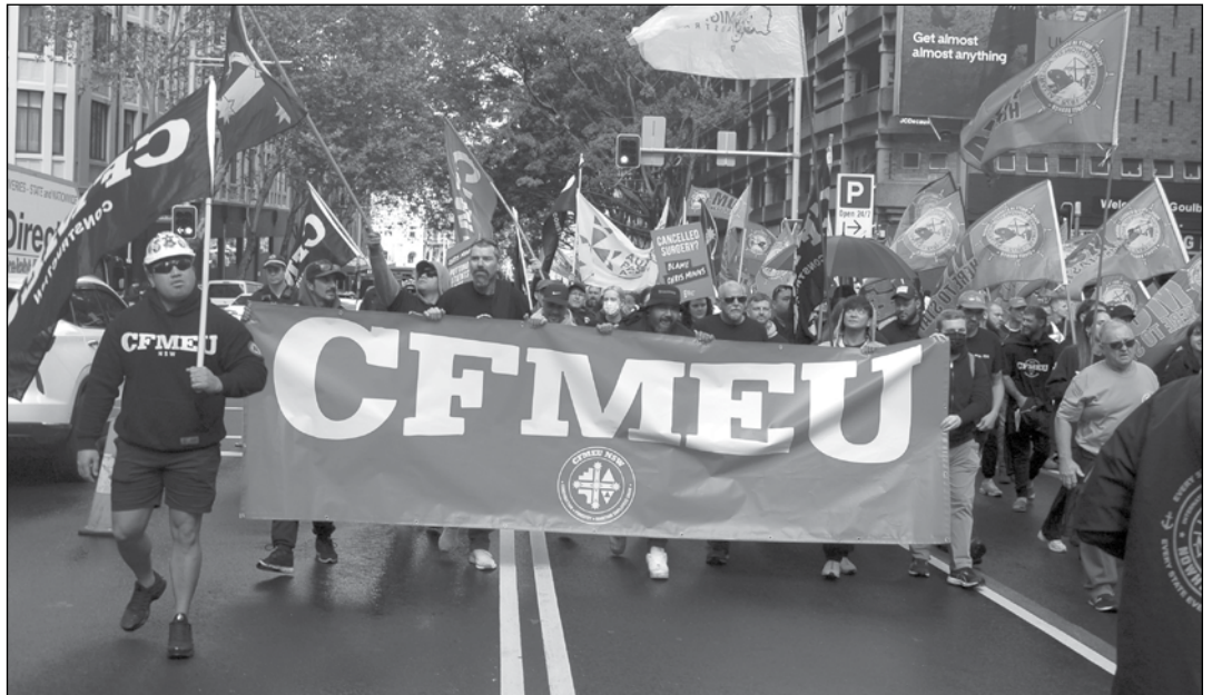
Above: CFMEU members at last year's May Day rally in Sydney