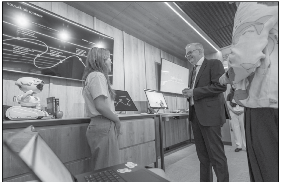
Above: Anthony Albanese visits a Microsoft office in Sydney to promote the use of AI Photo: Anthony Albanese

We are “slaves to the machine” even though the machines were de-