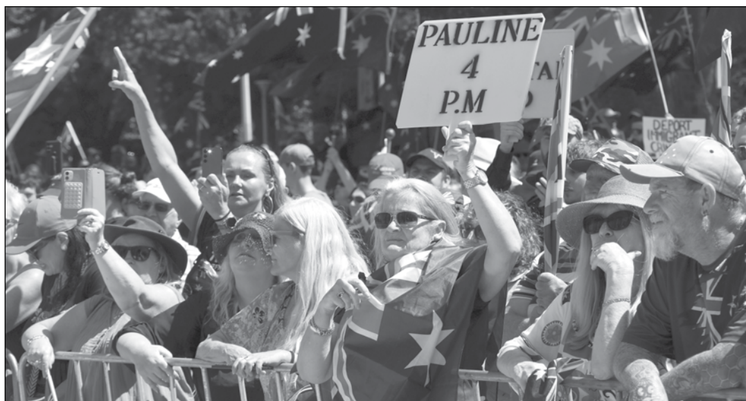
Above: One Nation supporters at a March for Australia rally in Sydney last year

Labor and the Coalition have fuelled this through matching each