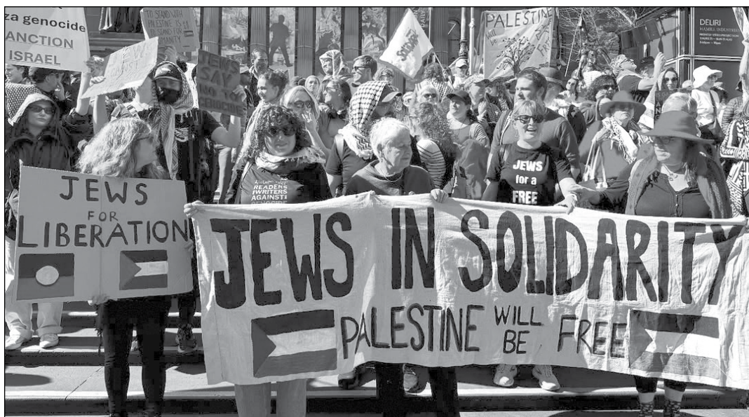
Above: The Royal Commission has refused to hear from Anti-Zionist Jews and those critical of Israel, like the Loud Jew Collective in Melbourne

One witness said he worried he might be killed at Mardi Gras earlier this year given pro-Palestine protests