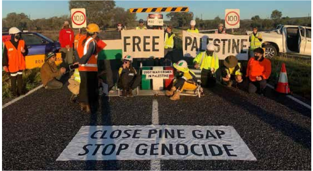
Above: Activists protesting at the entrance to the Pine Gap spy base

"We know that Pine Gap is clearly complicit in the horrors of this unchecked genocide in Palestine, and further across West Asia and globally as well. So what we're wanting to do