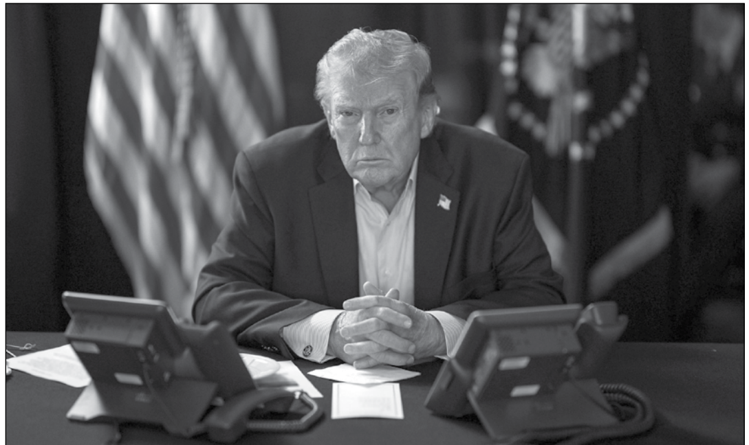
Above: Trump discussing the war with generals and Secretary of War Pete Hegseth

crash to its lowest ever level, with just 38 per cent approving his performance.