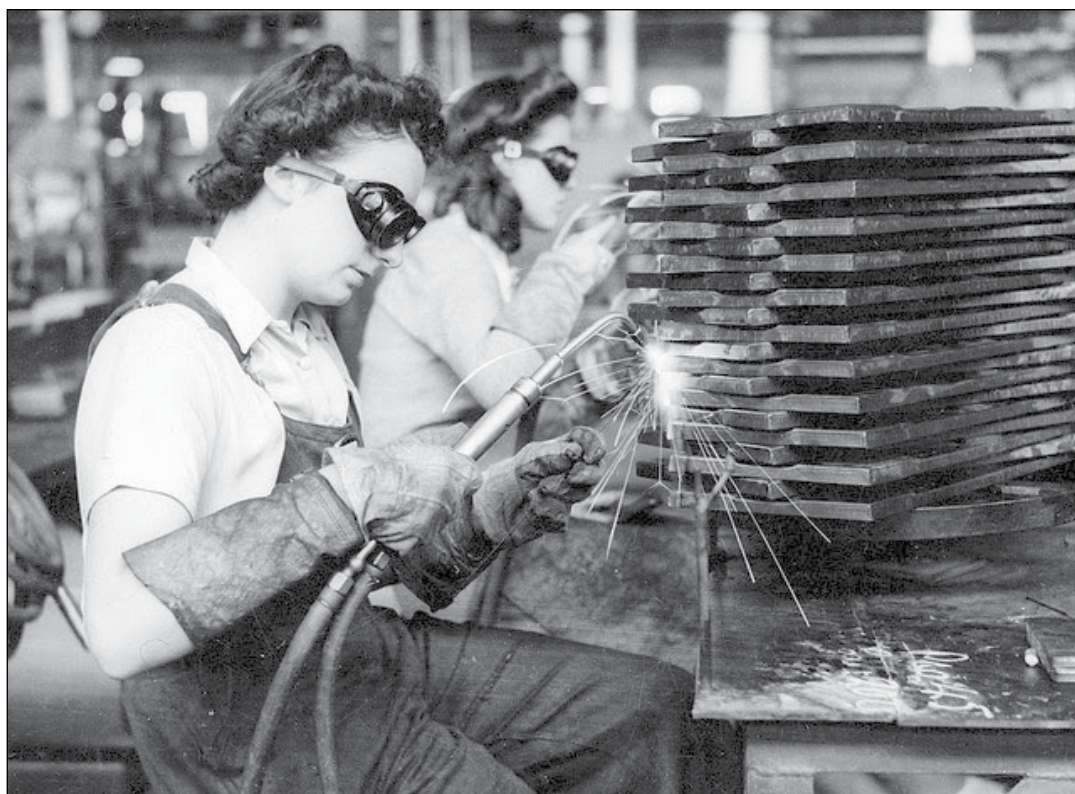
Above: Women working in a factory in South Australia during the Second World War

essed about keeping down women’s wages. This was despite the government agreeing to foot the bill for all manufacturing costs during the war, including any wage rises. They wanted to remind women that their work was a temporary evil for the war.