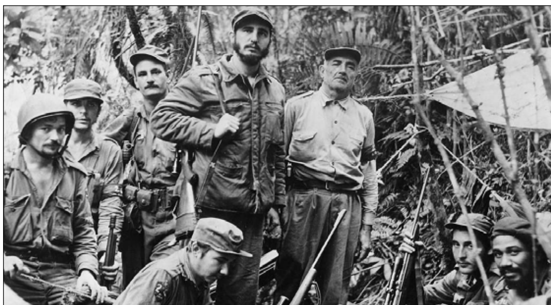
Above: Fidel Castro and his guerrilla fighters in the Sierra Maestra mountains in Cuba before taking power

While acknowledging Cuba's revolution did bring in genuine social reform for workers and much of Cuba's problems today stem from the heavy US sanctions, socialists need to be careful