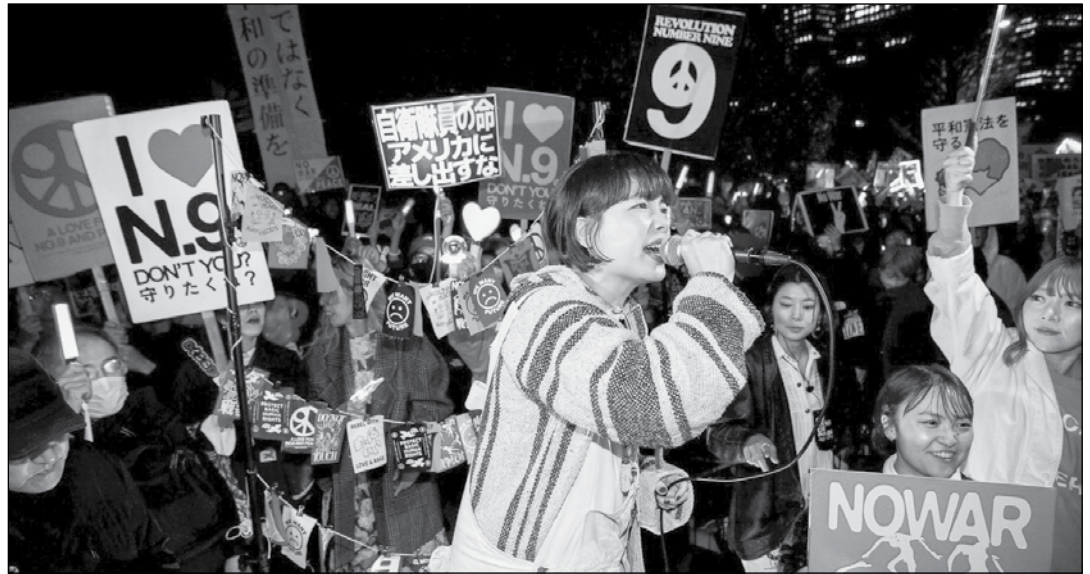
Above: An anti-war protest outside the Japanese parliament in April

In 2015 it passed legislation allowing “collective self-defence”, allowing Japanese forces to join wars in