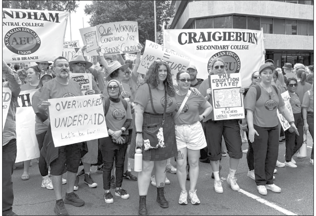
Above: Teachers in Victoria on strike on 24 March

Rank-and-file group Fight The Crisis has generated a detailed finan-